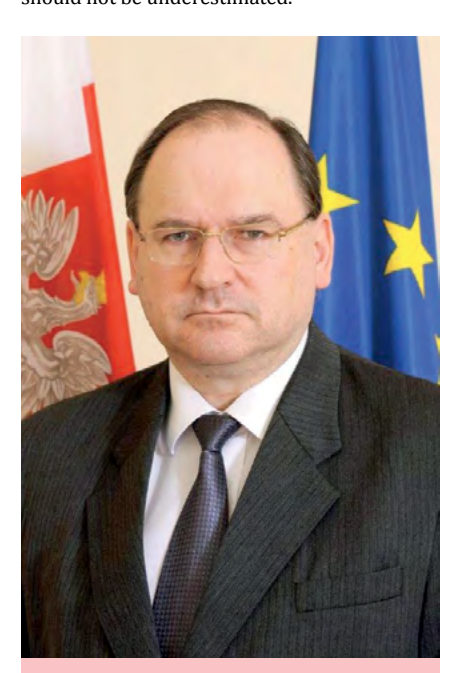
About the author: Henryk Litwin is Ambassador ad personam at the Department for Cooperation with the Polish Diaspora and Poles Abroad within the Ministry of Foreign Affairs of the Republic of Poland. From 2011 to 2016, he served as Polish Ambassador to Ukraine.

This was the nature of the Commonwealth created by its diverse membership of nationalities – Poles, Lithuanians, Ruthenians (Ukrainians), Prussians, Livonians and many more. The political and legal system derived its authority from the Crown and Kingdom of Poland, but the state relied on social agreement for its continued cohesion. Rather than relying on the unanswerable arguments of conquest, it emerged as an agreement of between 'the free and the free'. The impact this state had on European history in general, and Ukrainian history in particular, should not be underestimated.